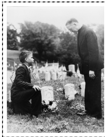
Father Flanagan at veteran's

You are fighting for the preservation of democracy which means the preservation of the freedoms that you and your forefa-